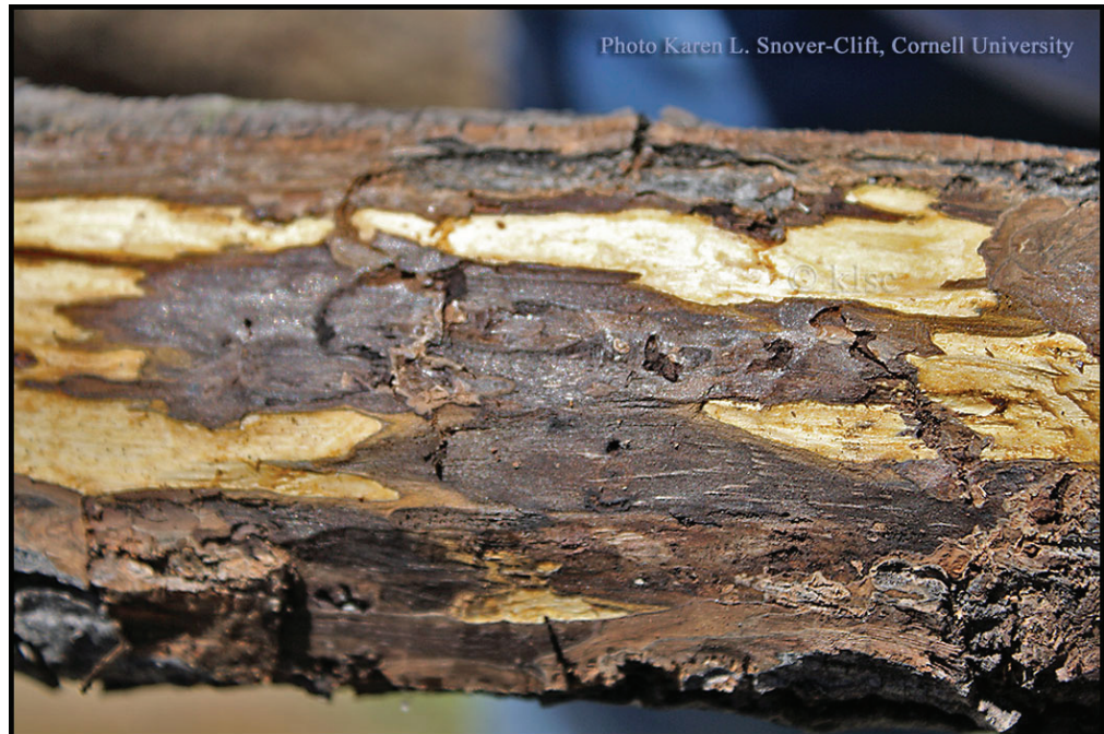
Clockwise from top left: early flagging symptoms on Juglans nigra . Juglans nigra showing more advanced dieback. Bark removed showing walnut twig beetle galleries and coalescing cankers. Juglans nigra branch with walnut twig beetle entrance and exit holes.