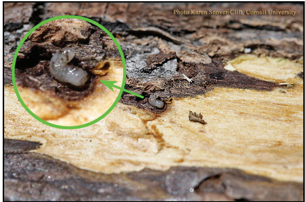
Clockwise from top left: adult walnut twig beetle, Pityophthorus juglandis , in gallery on black walnut. Pityophthorus juglandis adult. Pityophthorus juglandis , walnut twig beetle larva in gallery. Adult walnut twig beetles with penny for scale. For more information visit www.npdn.org/first_detector